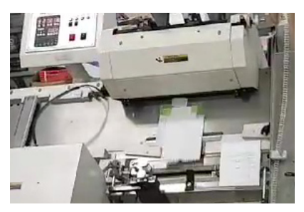
Back board & easel punch and feeder module