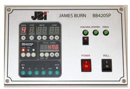
User friendly operation with control panel simple and easy to