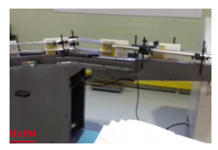
Feeding interlinking with flat-bed collator