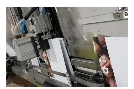
Nail hole punching module for calendars