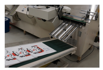
Smooth reception unit with electric conveyor