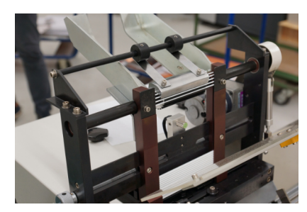
Hanger former and feeder module