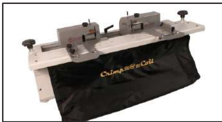
Robust, compact and ergonomic machine design