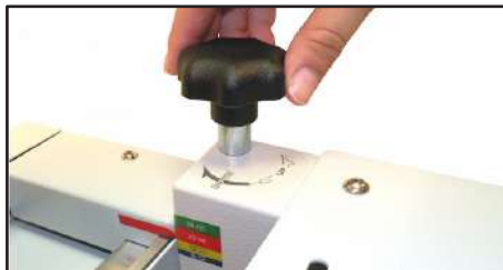
Work table height adjustment knob