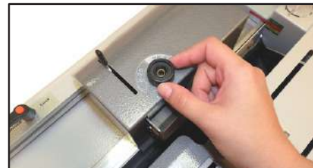
Adjustment knob for widening or narrowing the crimper to suit the selected coil size