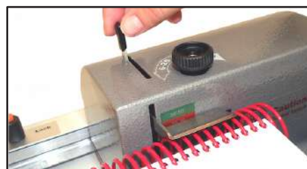
Lever for adjusting the spiral holder to suit the size of the spiral and the indications on the coloured strip