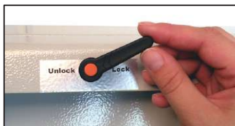
Safety device for locking and unlocking crimper settings