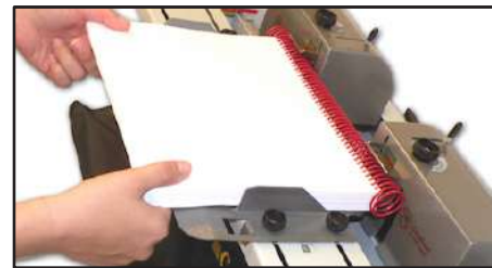
Safety for both hands of the operator, who must hold the document during the operation cycle