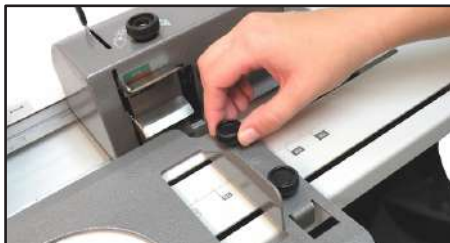
Markings to adapt the stops to the correct length of the documents to be crimped