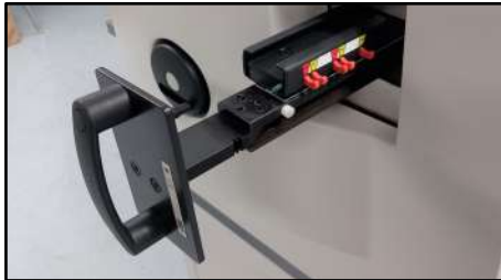
Easy tool change in less than 2 minutes