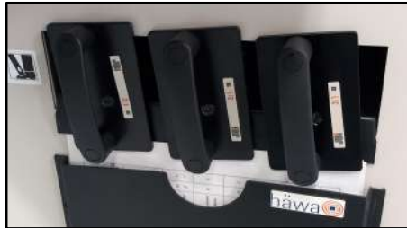
Storage space for 3 dies