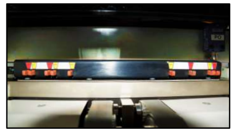
Wide range of quality punch dies with retractable pins