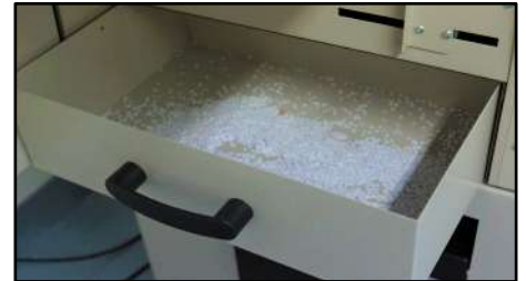
Large capacity waste bin