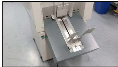
Reception with capacity up to 250mm (5 reams ~ 2 500 sheets)