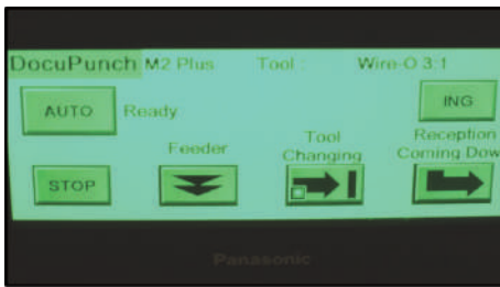
LCD touch screen interface