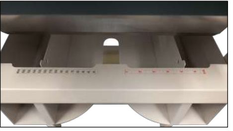
Possibility to adjust the widthness of the reception module for increased productivity