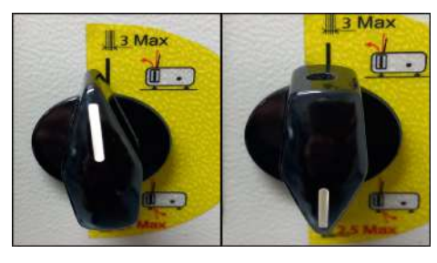
Punching and ejection of the sheets performed either from above or from below (in its optional reception module)