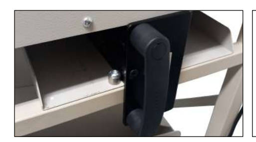
Storage space for changeover tools (up to 6 slots)