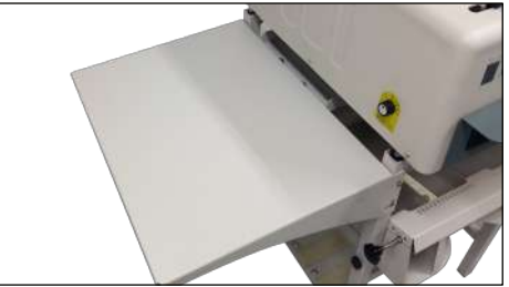
Presence of a folding table to meet practical needs